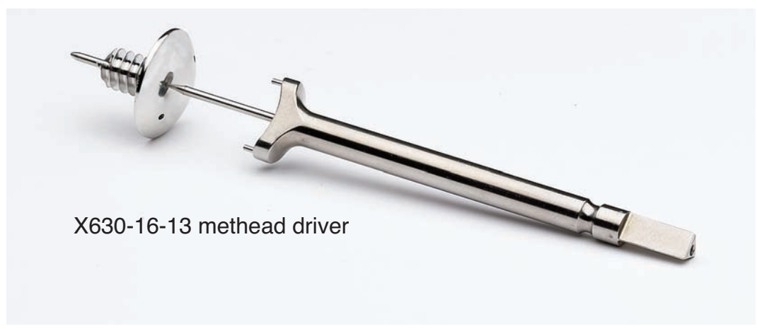
X630-16-13 methead driver